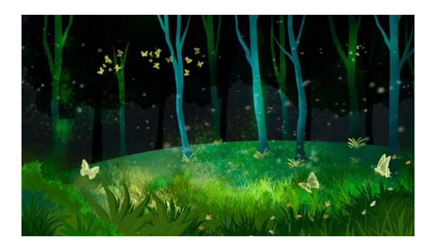
Allah SWT (God) Say:

"And of his signs is your sleep by day and by night and your seeking of his great bounty. Indeed, in that are signs for those who listen"